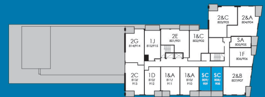
8th & 9th FLOORS

Purchasers are hereby advised that the plans, layouts, elevations, specifications, materials used, approximate areas or square footages are subject to change without notice, and the Vendor shall have no liability for any differences/variances between the final layouts, elevations, specifications, materials used and areas and those outlined above. See Sales Representative for details. All images are artist's concept only. SC