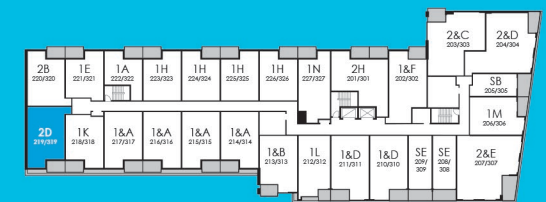
2nd & 3rd FLOORS