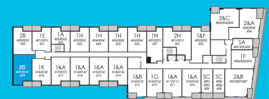
4th, 5th, 6th FLOORS

Purchasers are hereby advised that the plans, layouts, elevations, specifications, materials used, approximate areas or square footages are subject to change without notice, and the Vendor shall have no liability for any differences/variances between the final layouts, elevations, specifications, materials used and areas and those outlined above. See Sales Representative for details. All images are artist's concept only. 2D