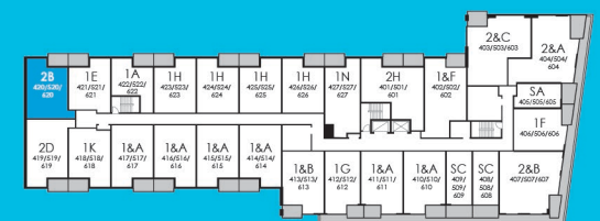
4th, 5th, 6th FLOORS

Purchasers are hereby advised that the plans, layouts, elevations, specifications, materials used, approximate areas or square footages are subject to change without notice, and the Vendor shall have no liability for any differences/variances between the final layouts, elevations, specifications, materials used and areas and those outlined above. See Sales Representative for details. All images are artist's concept only. 2B