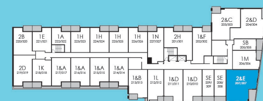
2nd & 3rd FLOORS

Purchasers are hereby advised that the plans, layouts, elevations, specifications, materials used, approximate areas or square footages are subject to change without notice, and the Vendor shall have no liability for any differences/variances between the final layouts, elevations, specifications, materials used and areas and those outlined above. See Sales Representative for details. All images are artist's concept only. 2+E