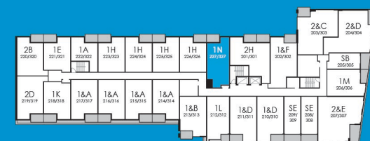
2nd & 3rd FLOORS