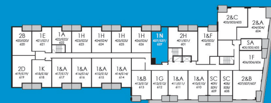
4th, 5th, 6th FLOORS

Purchasers are hereby advised that the plans, layouts, elevations, specifications, materials used, approximate areas or square footages are subject to change without notice, and the Vendor shall have no liability for any differences/variances between the final layouts, elevations, specifications, materials used and areas and those outlined above. See Sales Representative for details. All images are artist's concept only. 1N