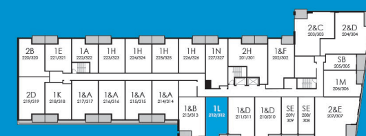
2nd & 3rd FLOORS

Purchasers are hereby advised that the plans, layouts, elevations, specifications, materials used, approximate areas or square footages are subject to change without notice, and the Vendor shall have no liability for any differences/variances between the final layouts, elevations, specifications, materials used and areas and those outlined above. See Sales Representative for details. All images are artist's concept only. 1L