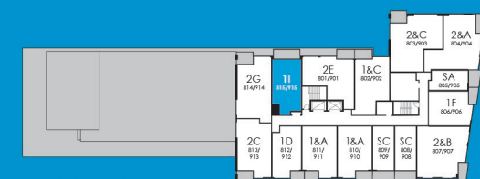
8th & 9th FLOORS