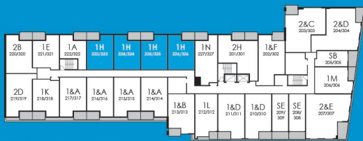
2nd & 3rd FLOORS