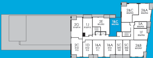
8th & 9th FLOORS