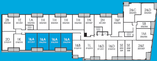
2nd & 3rd FLOORS

+ BALCONY 57 sq.ft. (4TH FLR: TERRACE 86 sq.ft.)