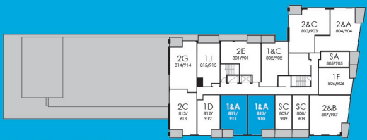
8th & 9th FLOORS